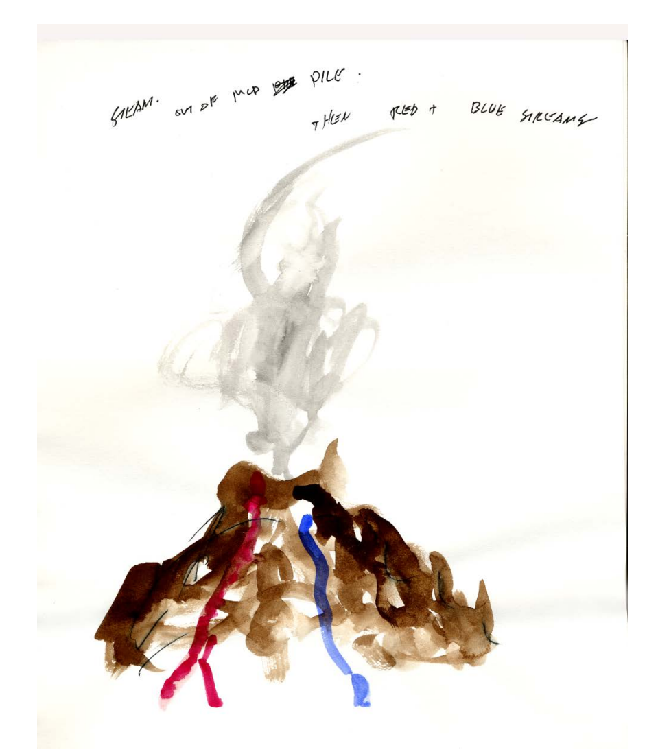
Sketch by Robert Whitman for Passport