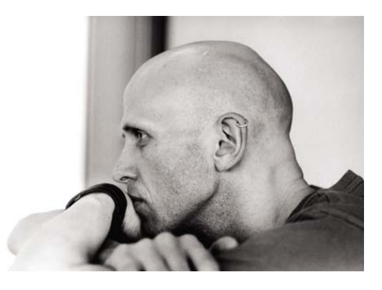
Wayne McGregor

A centerpiece of WM|RD's residency was a research and education week that featured Brainstorm: A Symposium on Creative Thinking on April 12, 2011. Spearheaded by R-Research, the afternoon pursued the same question as the then-emerging Creative Thinking course: how do we define creativity in such a way that it becomes accessible to